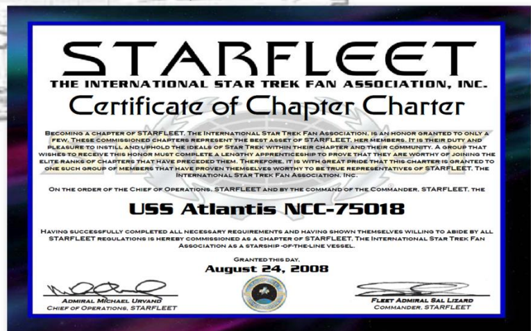
USS Atlantis Certificate of Chapter Charter