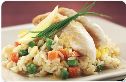
Sulu's Lemon Chicken – Serving Suggestion

Brown the chicken on both sides over medium heat (it should take about 20 to 30 minutes) and then add the marinade and simmer until the chicken is well cooked for approximately 30 minutes.